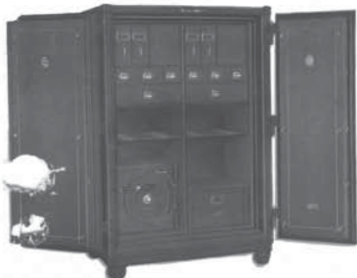
No. 4160A Safe. Item No. S-26-1309 with chest installed.

These Chests are not included in Procurement Division Schedule of Safes. For prices and other information, communicate with The Mosler Safe Co., Hamilton, Ohio, or nearest branch.