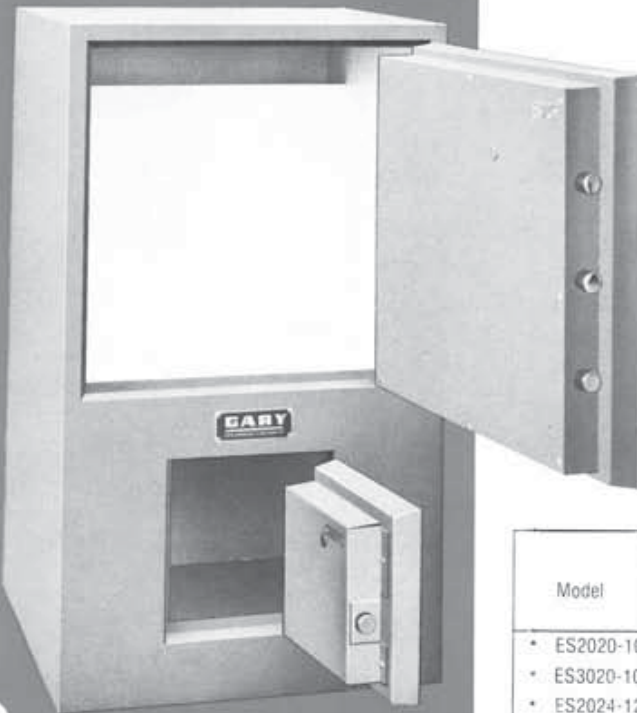
MODEL ES 2020-10